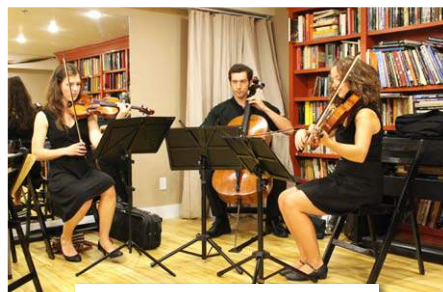
Chamber music was performed