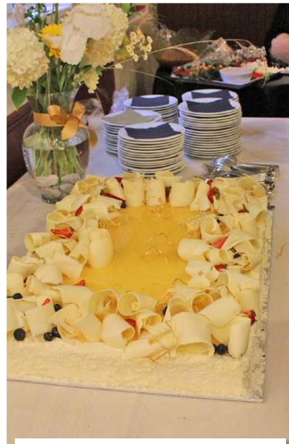
A delicious cake made the event special