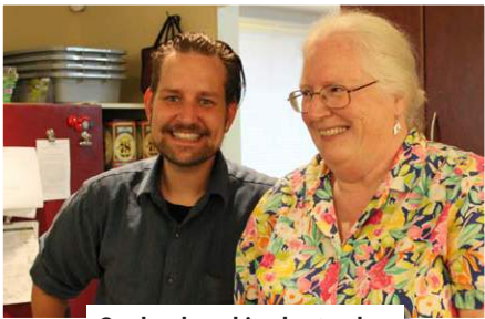
Our hard-working bartenders