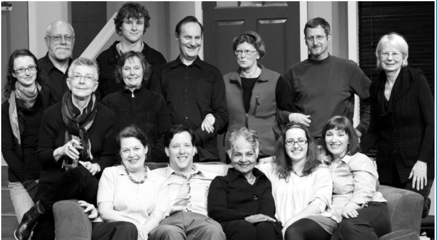
Rabbit Hole March 7 th to March 24 th , 2012

Can anyone help with identifying the young lady with glasses and a scarf on the far left? I can be reached at marilynjk@gmail.com