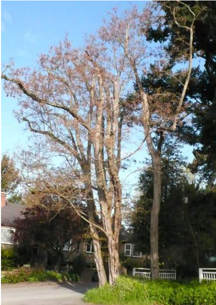
A cluster of old and dying trees has been removed.

Most of the logs are huge. Some almost 2 feet in diameter. We salvaged a large, 12-foot-long part of one of the trees for part of the set of Humble Boy and the rest was offered for free firewood to anyone who wanted it.