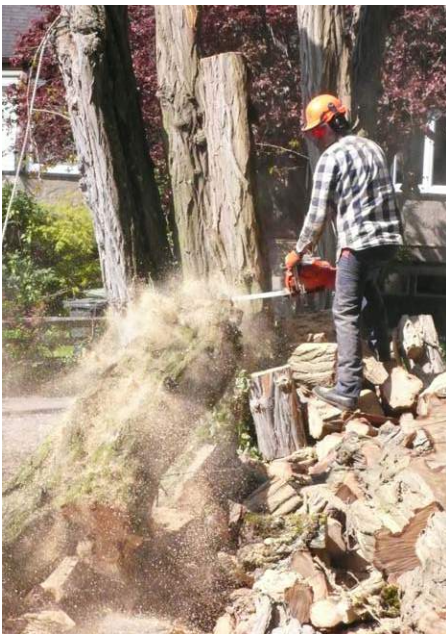
A professional tree removal company and a chainsaw make short work of the problem.