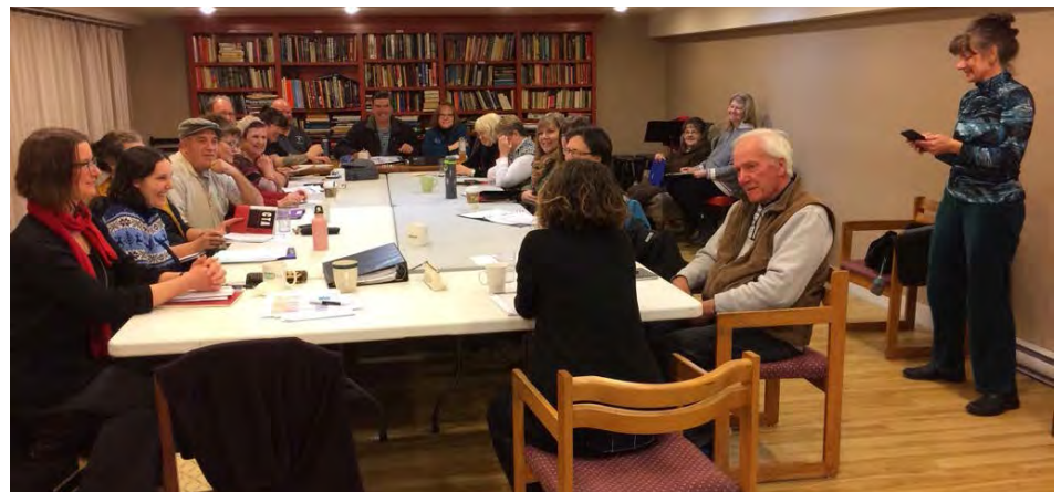
The Stage Management workshops, held on February 18 and 19, were well attended.