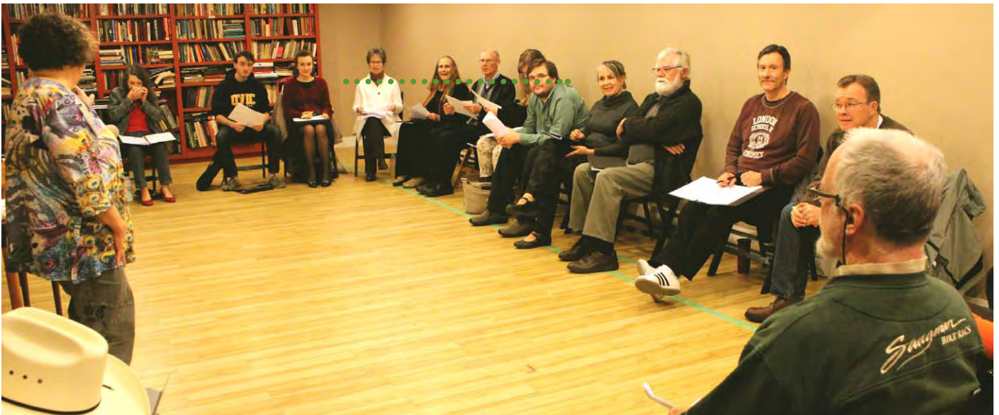
The very large cast of Spooky Shakespeare in one of their rehearsals before their Readers' Theatre performance on Halloween.