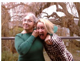
Having a hard time being heard?