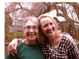
If you join a workshop, we'll listen.