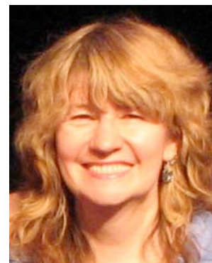
The Stage Manager