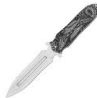
Entangled in the Plot

Who done it? Come to Langham Court and find out!