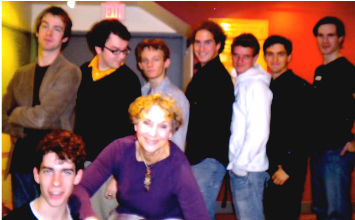
The boys and their mistress