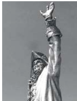
Tommy at the Harbour