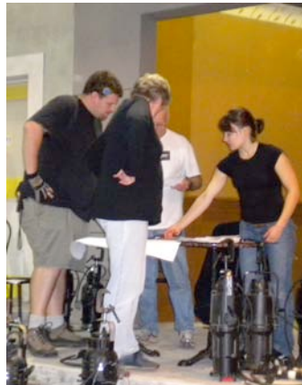
The Players consider their parts