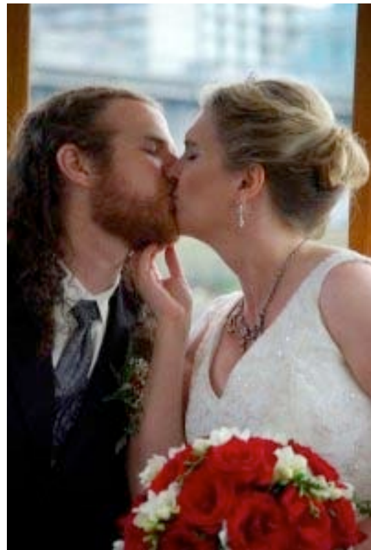
Bride and Groom's first kiss