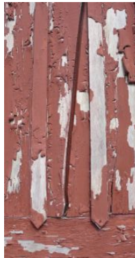
Detail of one of the boards in very poor shape.