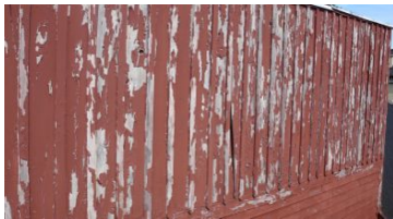
The exterior east wall (before).

Few people can even see the walls re-built over the stage structure, but Bill Adams told us that it looked pretty bad when seen from Rockland Avenue. When we were up in the gulley cleaning between the buildings we saw what he meant. "Peeling paint" is an understatement. We tried to scrape it and power-wash it but it became apparent that the underlying wood was in poor shape. So we decided to remove the old battens and cover the entire wall with treated plywood and add fake battens for appearance. The resulting wall should last for a decade or more. The pictures below show the before and after state of this wall.