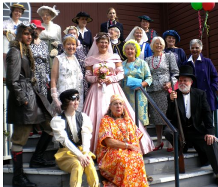
150 years of fashion

From Heritage Productions and Langham Court Theatre