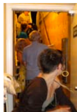
Finally, it was clean up time