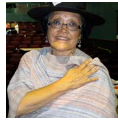
and some even modelled.