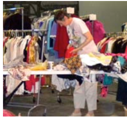
They were sorted