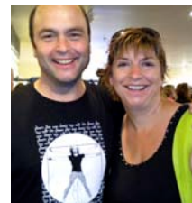
connected with old friends,