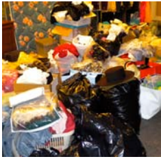
The Costumes arrived.