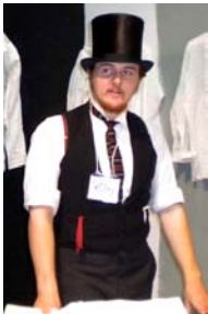
were served by elegant Salesmen,