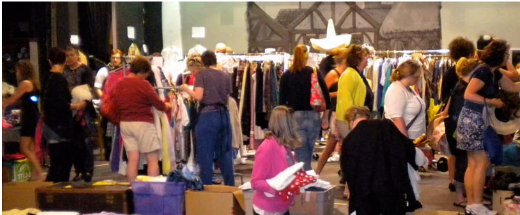
Then the people came,