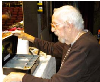
paid our experienced cashiers,