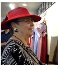
and delighted in their new-found treasures.