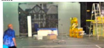
and the end until next summer