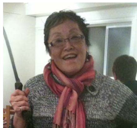
About to cut the cake at her birthday during The Drowsy Chaperone .