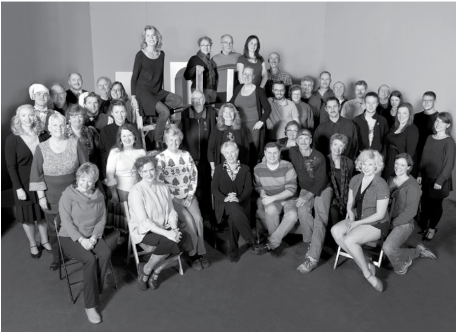
Cast and Crew of The Drowsy Chaperone