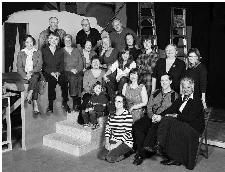
Cast and Crew of Rabbit Hole