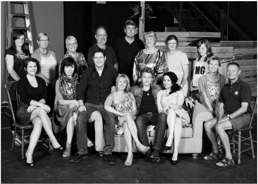
Cast and Crew of The Melville Boys