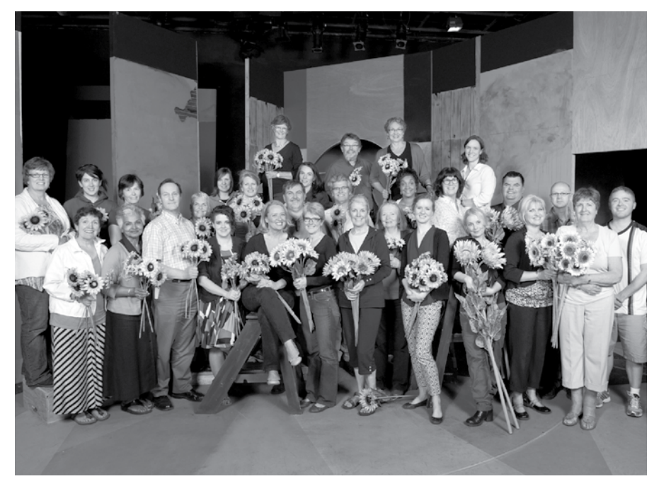
Cast and Crew of Calendar Girls