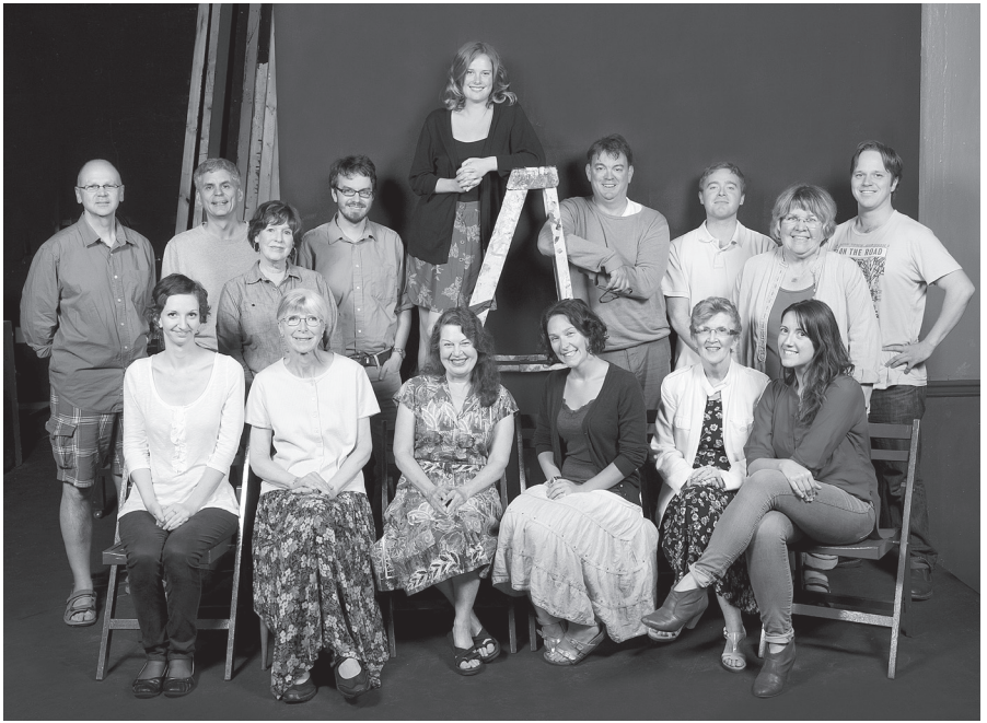
Cast and Crew of Harvey