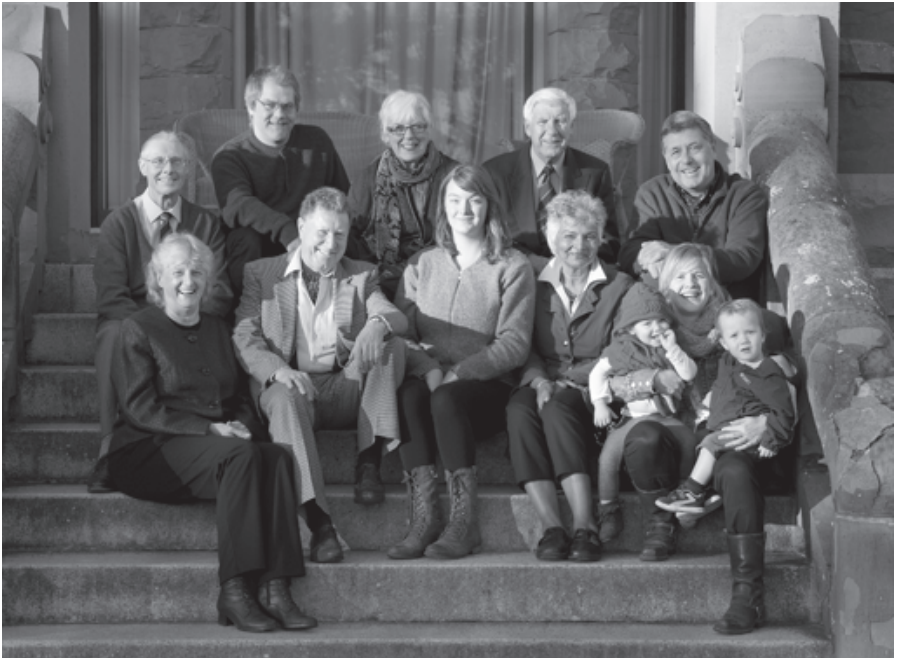
Cast and Crew of Heroes