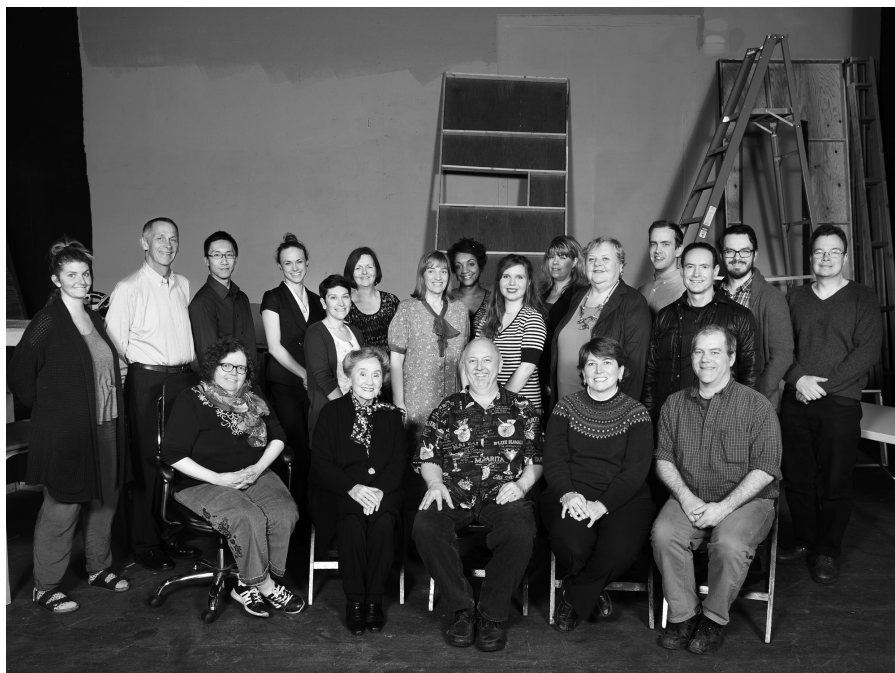
Cast and Crew of Escape from Happiness