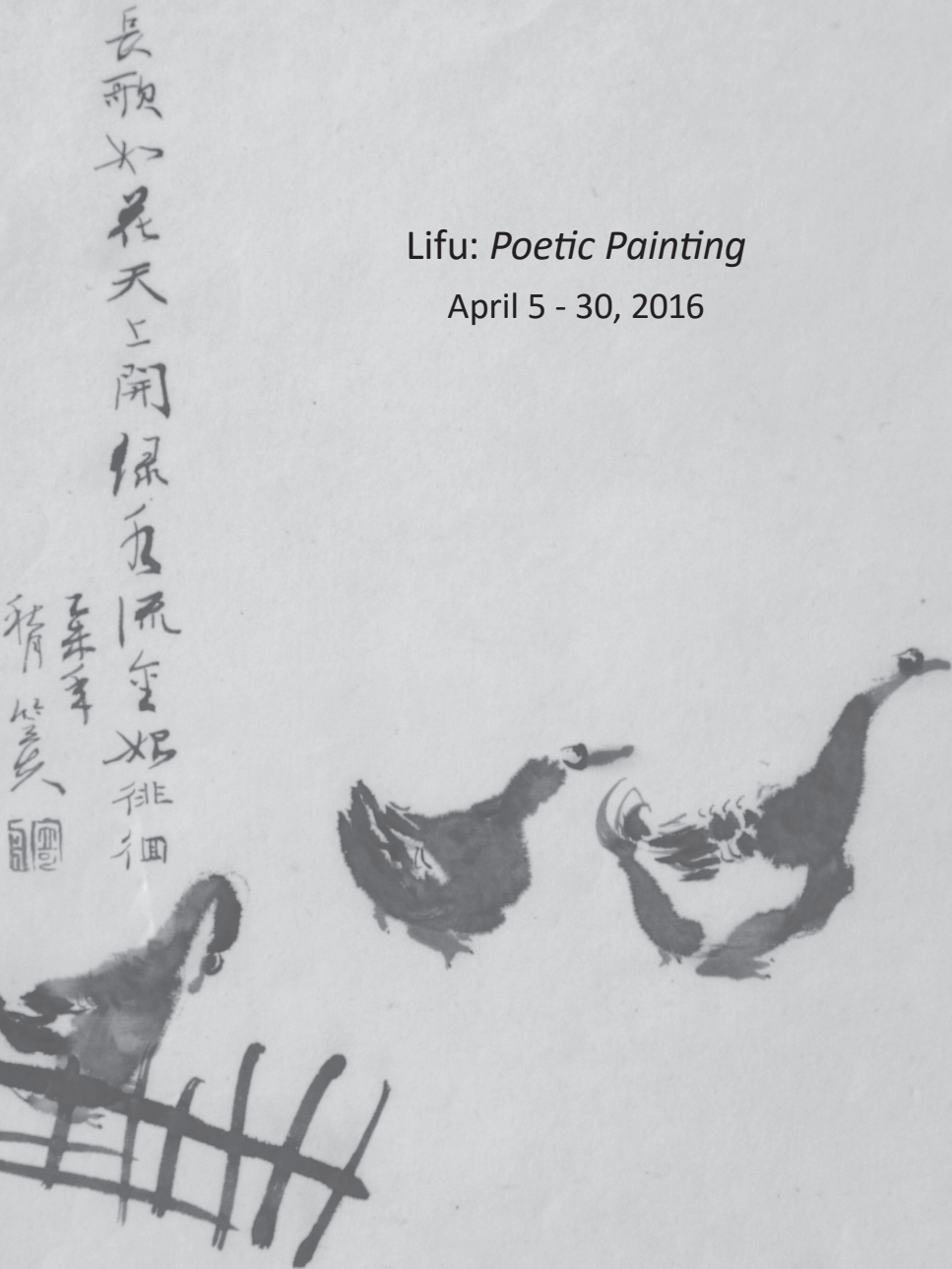
Three Ducks in the Garden, wc, 13.5" x 10"