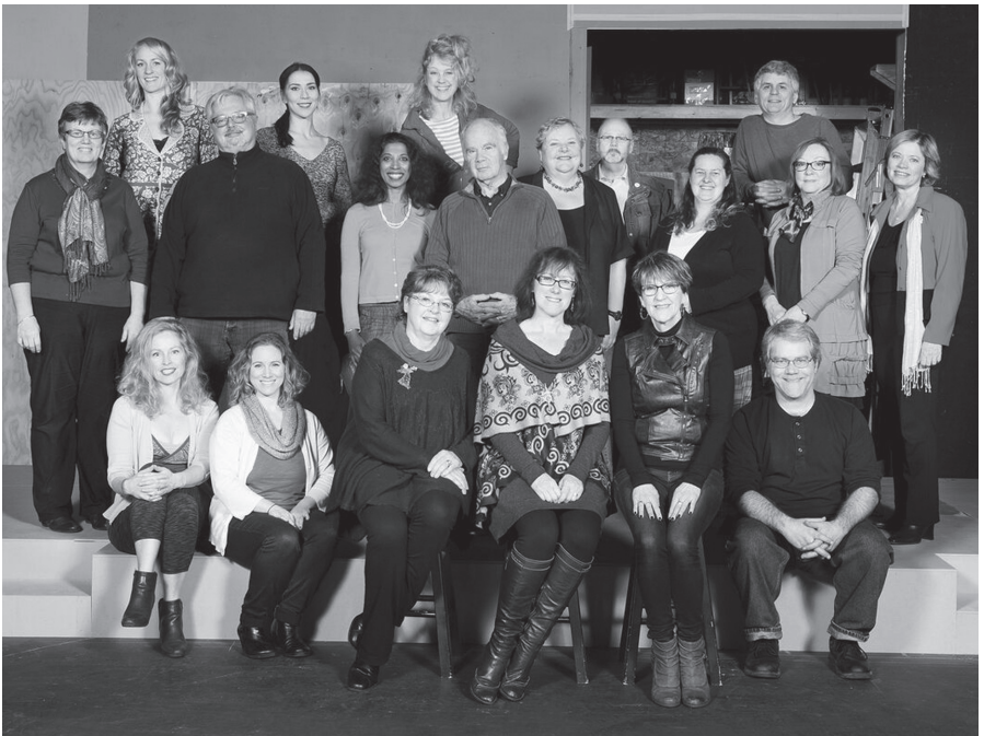
Cast and Crew of Stepping Out