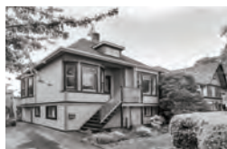
Sold! Fairfield Character Home