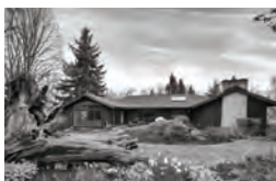
Sold! Fairfield Mid Century Style