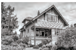
Sold! Fairfield Character Home

Providing a complimentary marketing package. So your home will be presented at its finest. Staging, Photography, HD Video Tours, Floor Plans, Brochures, Print & Web Marketing. Please visit MelinaBoucher.ca to find out more.