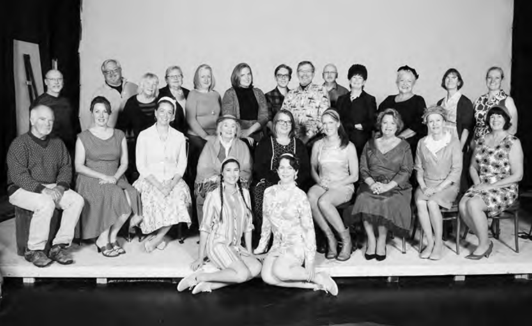
Cast and Crew of Les Belles-Soeurs