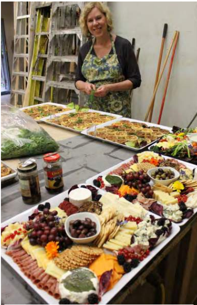
Lots of delicious food, hot and cold.