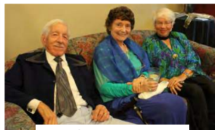
More volunteers enjoying a visit.