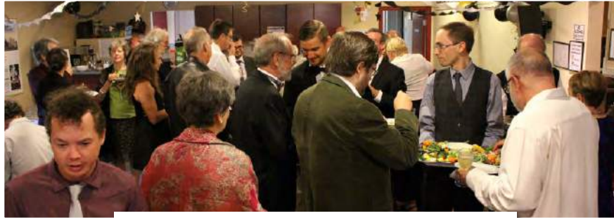
There was a great turnout in our beautifully decorated lounge.