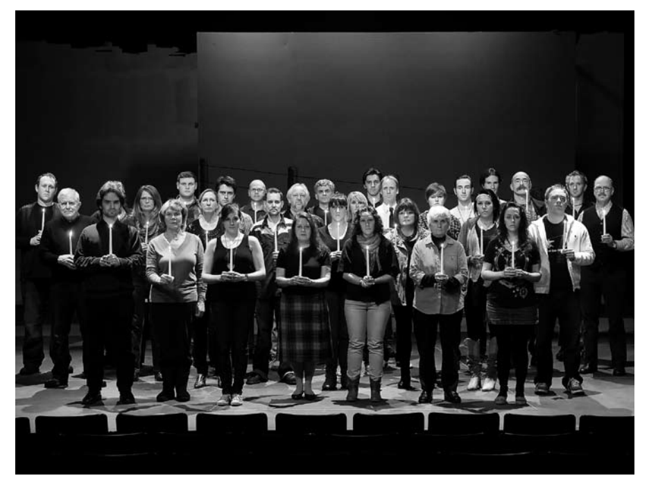
Cast of The Laramie Project