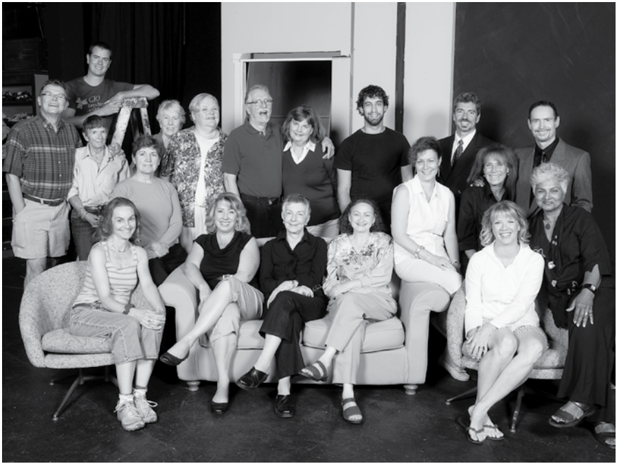
Cast and Crew of The Odd Couple - Female Version