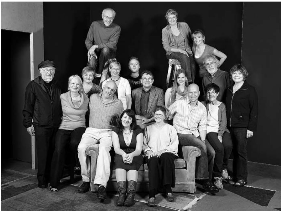
Cast and Crew of Perfect Wedding