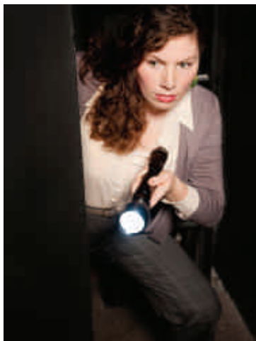
THE SMALL ROOM AT THE TOP OF THE STAIRS 2014