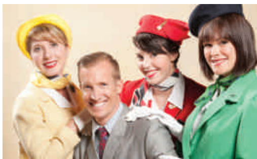
BOEING BOEING 2014