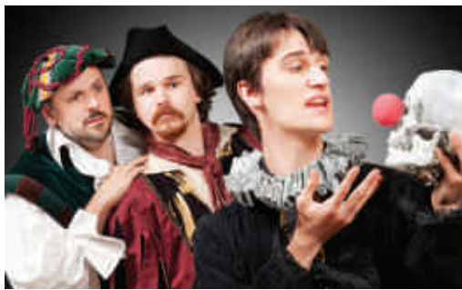
ROSENCRANTZ & GUILDENSTERN ARE DEAD 2014