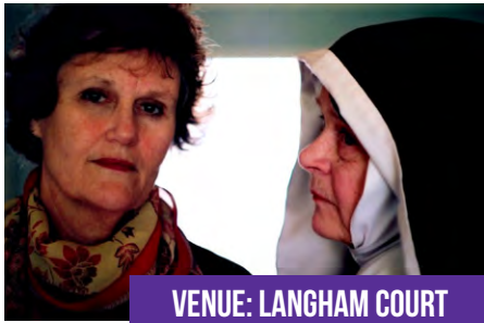
VENUE: LANGHAM COURT

Langham is once again pleased to be a Victoria Fringe Festival venue and a number of our members are involved with this year's event. Fringe ticket/button information can be found on Intrepid Theatre's website at intrepidtheatre.com/festivals/fringe-festival/tickets-passes/