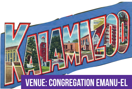
VENUE: CONGREGATION EMANU-EL

Tickets: Adults $11, students/seniors $9