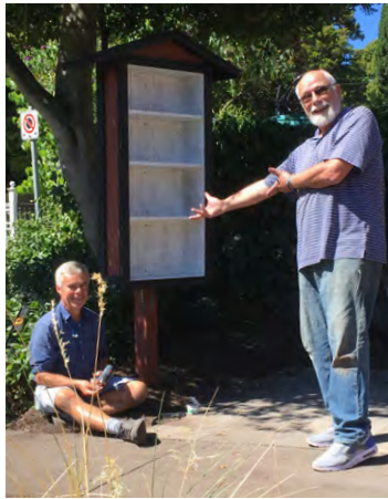
Please feel free to drop off books in our outside book nook.