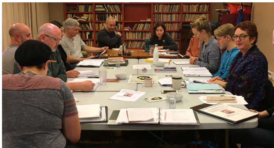
First exciting read-through.