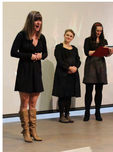
A few of the cast from The 25th Annual Putnam County Spelling Bee entertained at the Langham Christmas party with a couple of songs from the show.

If you have time to help put up some 25th Annual Putnam County Spelling Bee posters in January, please stop by the Box Office to pick some up.