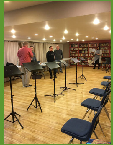
Workshopping In Bloom for the October 20 staged reading.