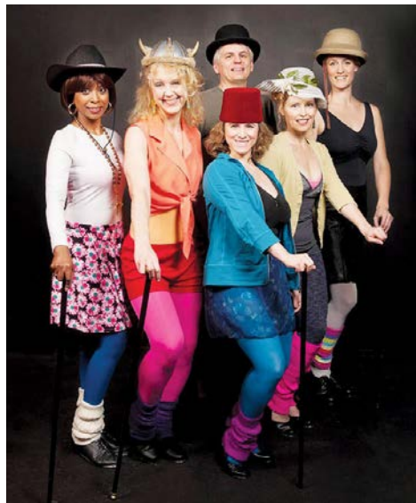
A promo shot of the cast of Langham's 2016 production of Stepping Out .

Thank you Marilyn for putting in the time and work of going through our archived photos to compile this information. These are very hopeful numbers but we still have a lot of work to do with increasing diversity in our theatre, and insuring equity and safety among our volunteers.