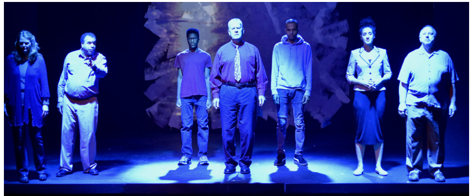
A co-production by Attitude Theatre, Langham Court Theatre, and Bēma Productions

Like us on Facebook! www.facebook.com/langhamtheatre