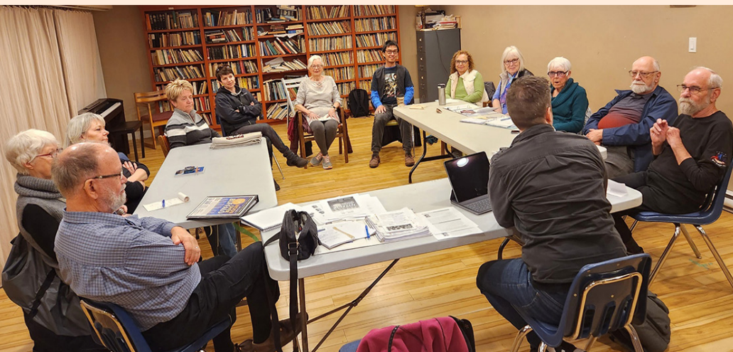
Discussing details for the upcoming opening, at a Moon Over Buffalo production meeting