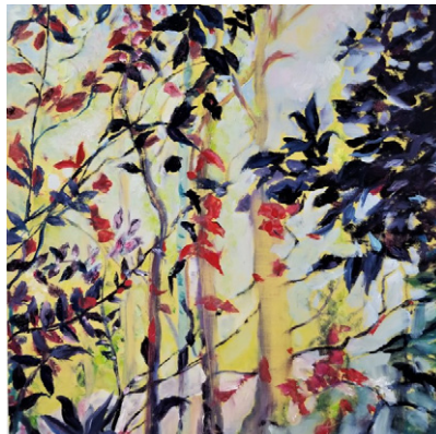
At Butchart Garden

Beauty is in the eye of the beholder and Arden sees beauty in the natural world, old buildings, and in the human form. All