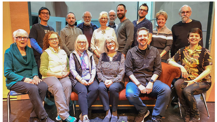
Some of the awesome MOB production team and crew.

Evening performances start at 7:30 p.m. and there's an extra Saturday matinee (May 20) for Moon Over Buffalo. Visit the Langham website for tickets at langhamtheatre.ca