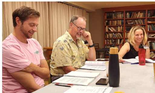
Having fun at the first readthrough.