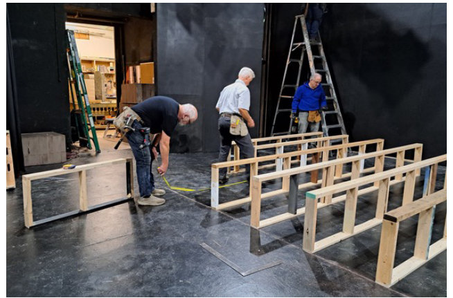
▲ Set construction crew is hard at work creating the work of J.M. Barrie.