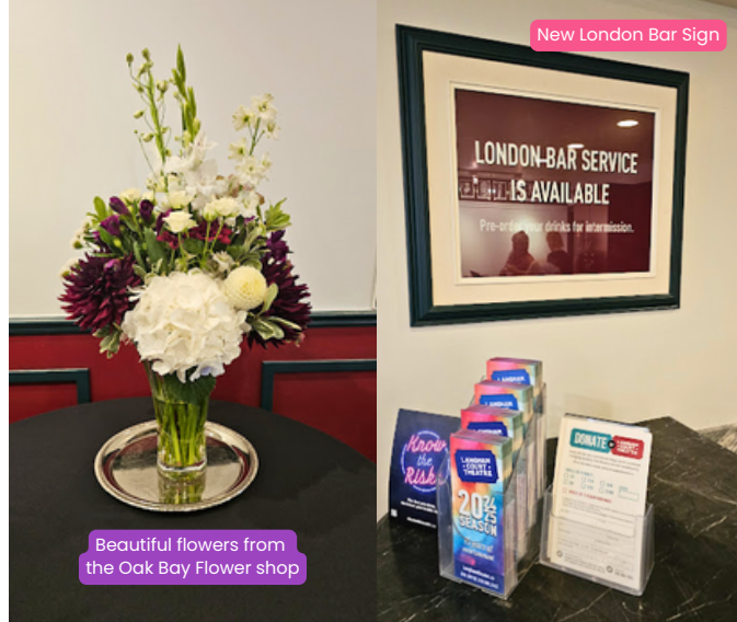
Beautiful flowers from the Oak Bay Flower shop