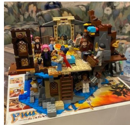
Lego model of the set by actor Ty DeLisle